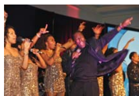
Gentlemen of Leisure