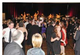
Gala guests on the dance floor